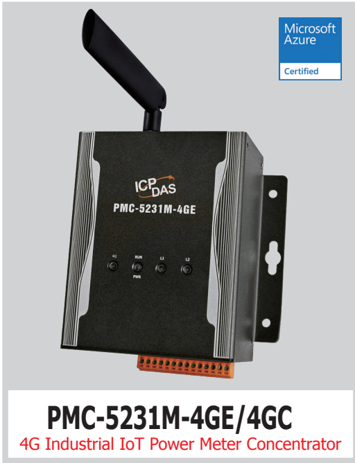
PMC-5231M-4GE/4GC 4G Industrial IoT Power Meter Concentrator